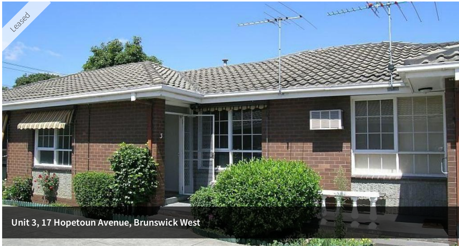
Unit 3, 17 Hopetoun Avenue, Brunswick West