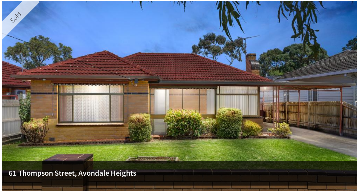
61 Thompson Street, Avondale Heights