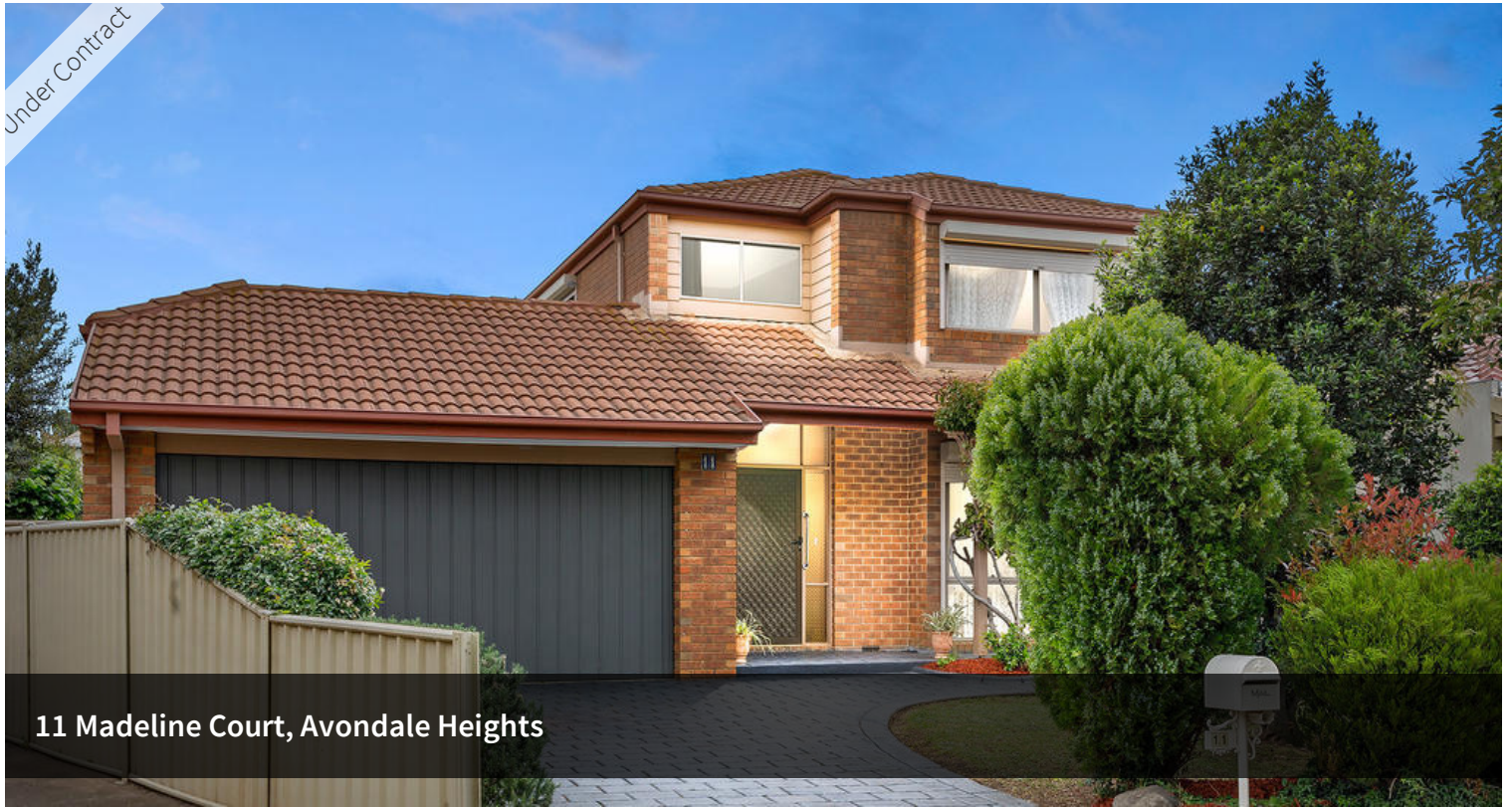
11 Madeline Court, Avondale Heights