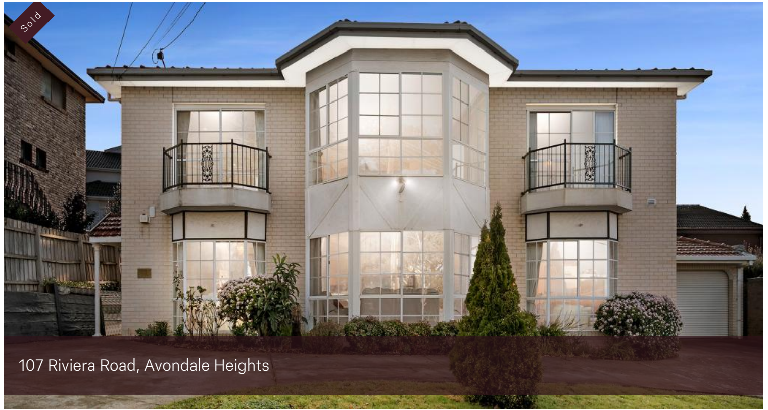
107 Riviera Road, Avondale Heights