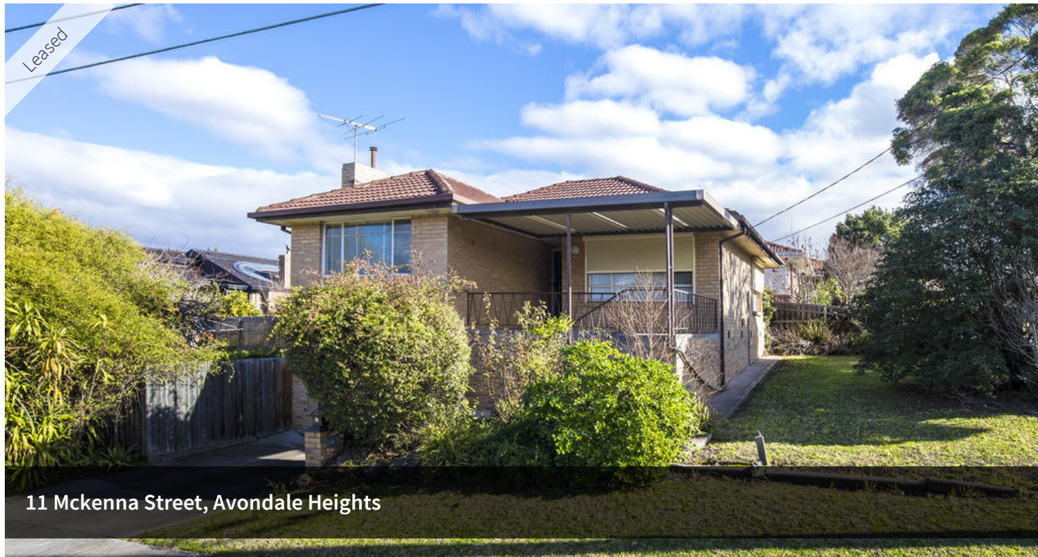
11 Mckenna Street, Avondale Heights