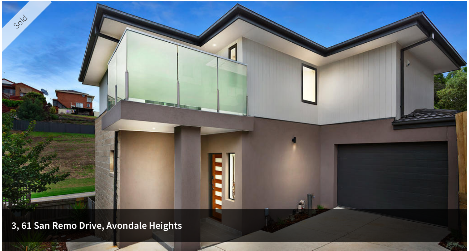
3, 61 San Remo Drive, Avondale Heights