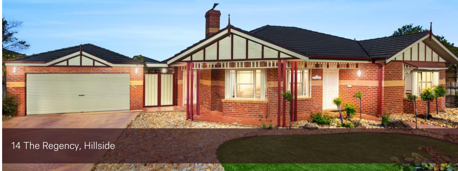
14 The Regency, Hillside