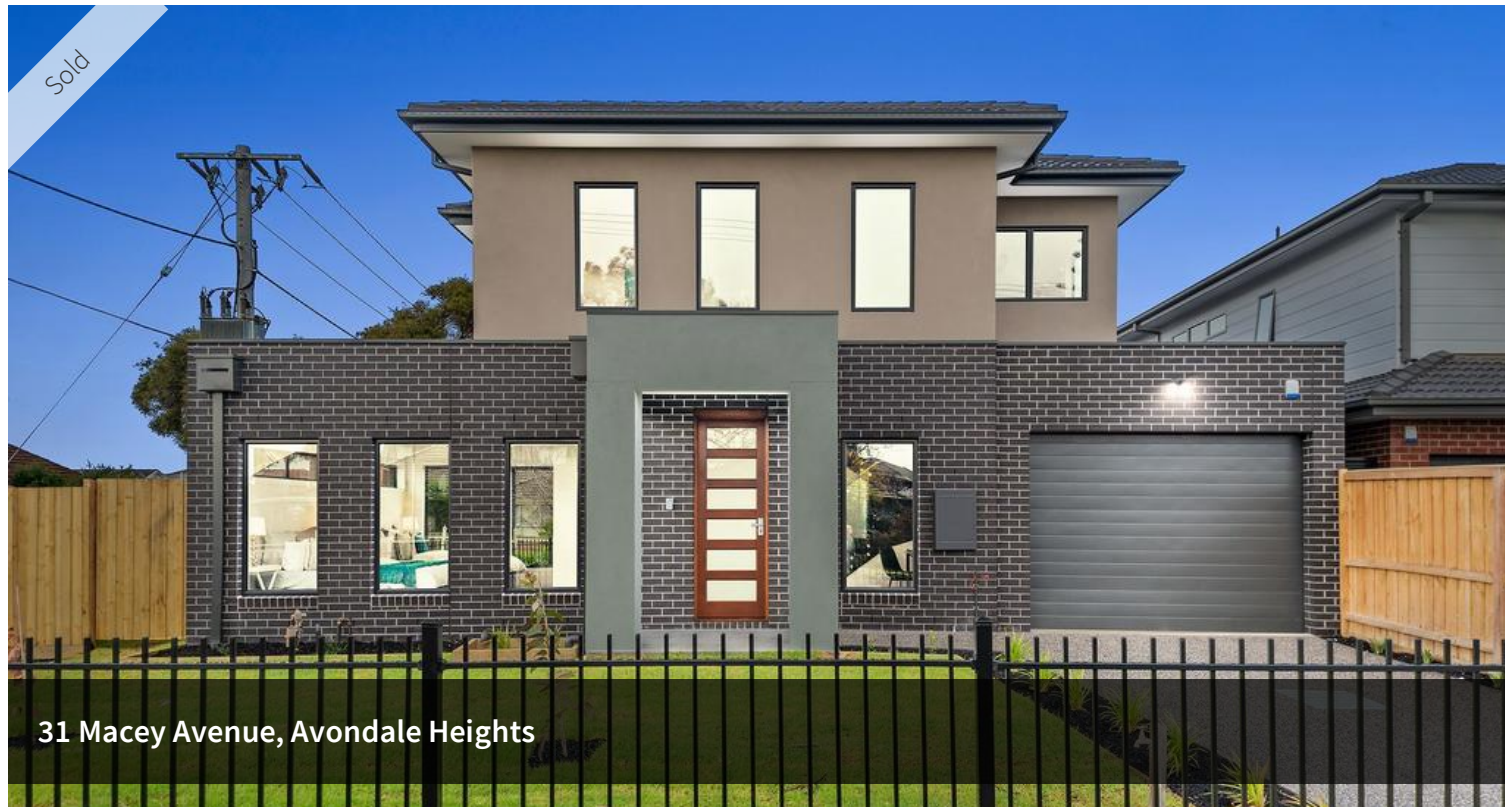
31 Macey Avenue, Avondale Heights