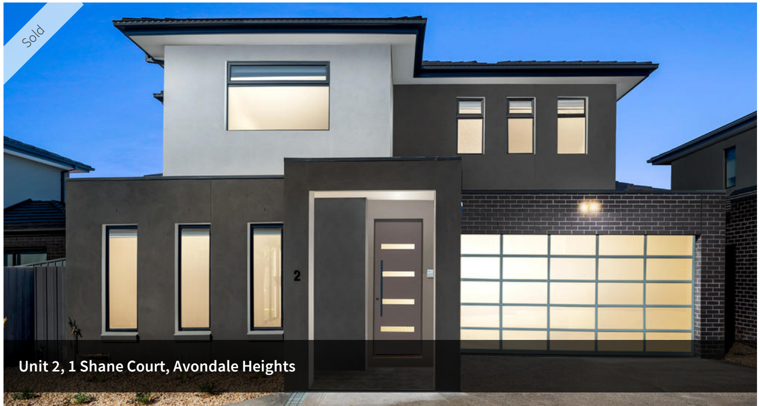
Unit 2, 1 Shane Court, Avondale Heights