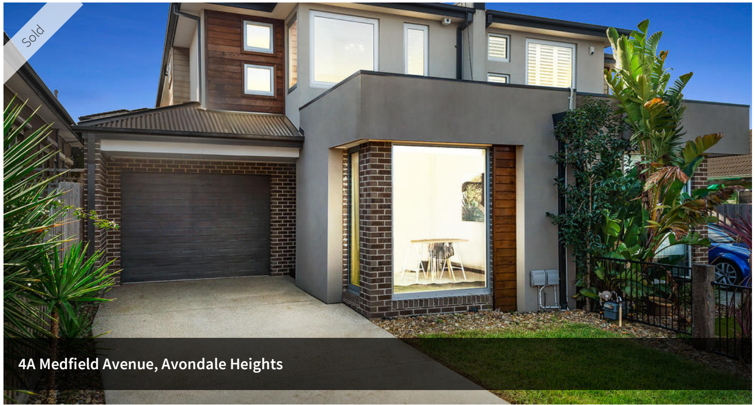
4A Medfield Avenue, Avondale Heights