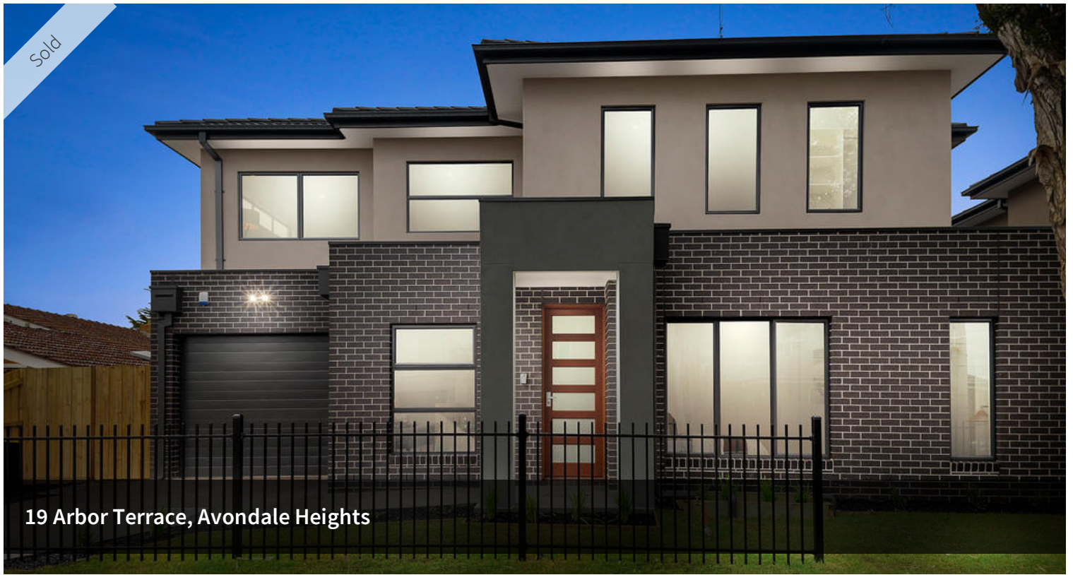
19 Arbor Terrace, Avondale Heights