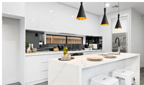
19 Arbor Terrace, Avondale Heights