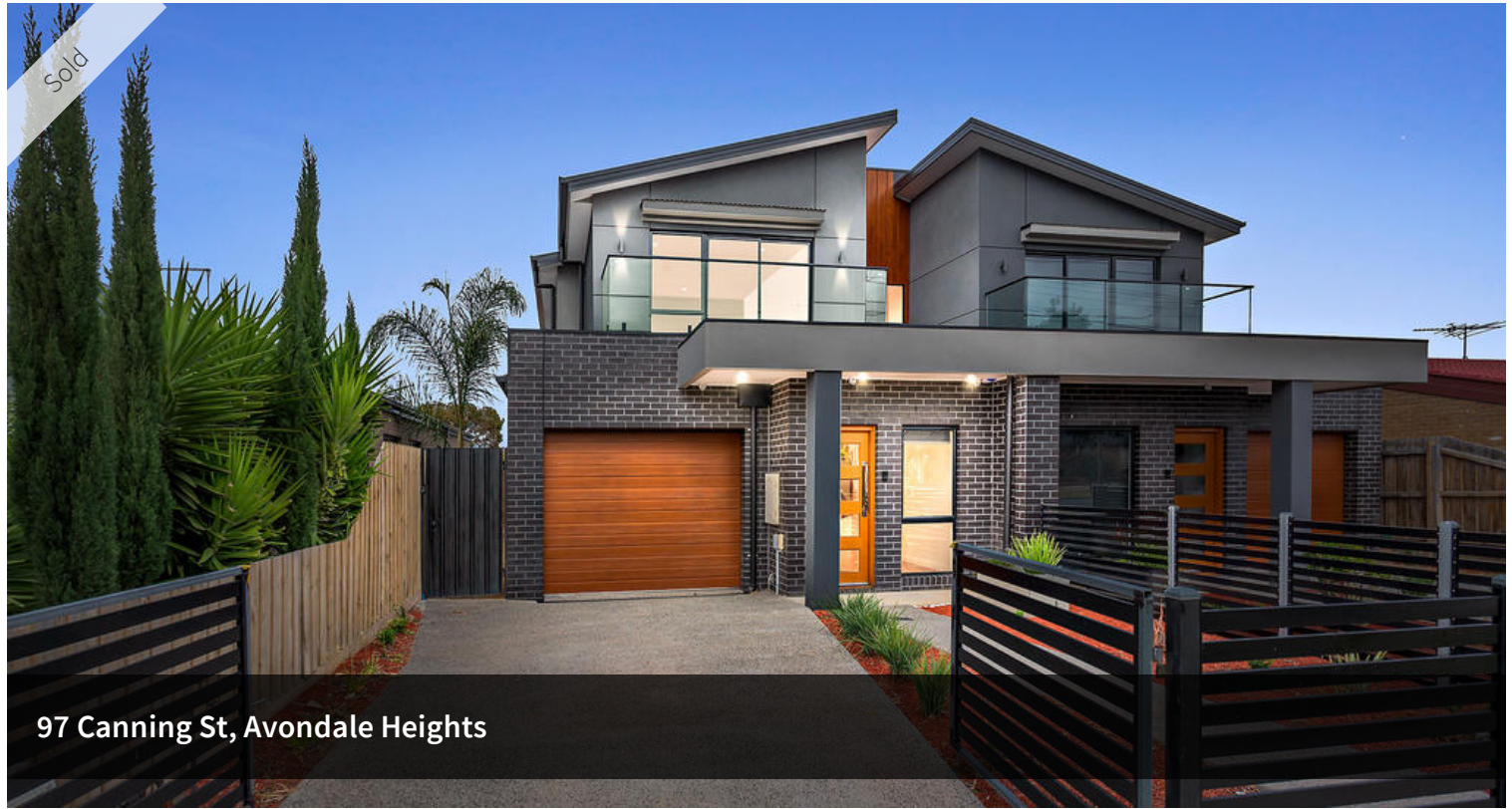
97 Canning St, Avondale Heights