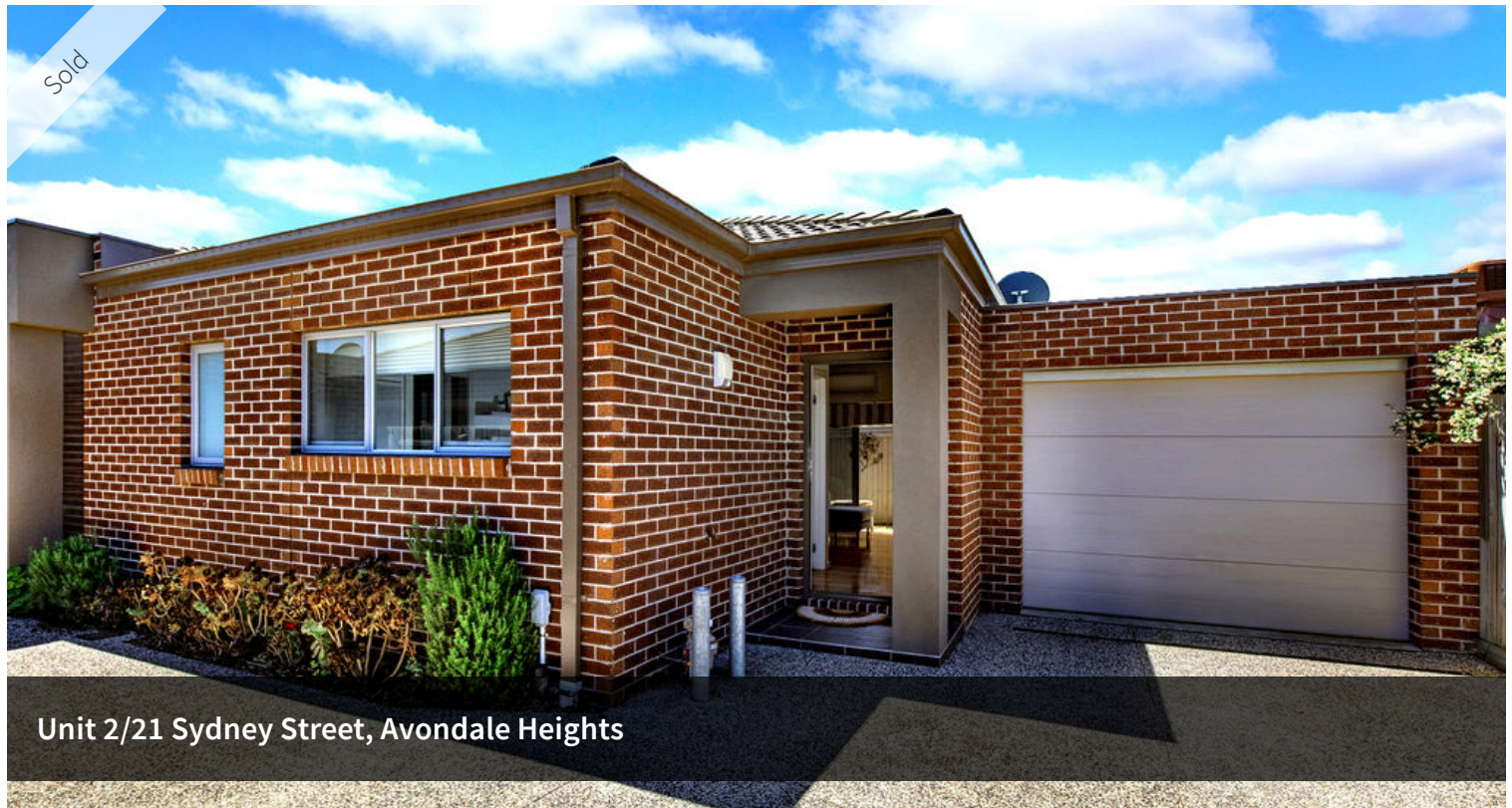
Unit 2/21 Sydney Street, Avondale Heights