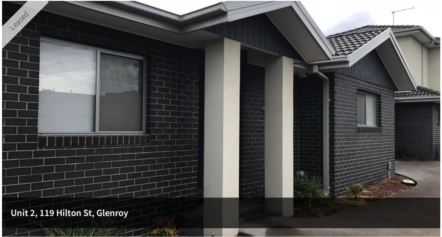
Unit 2, 119 Hilton St, Glenroy