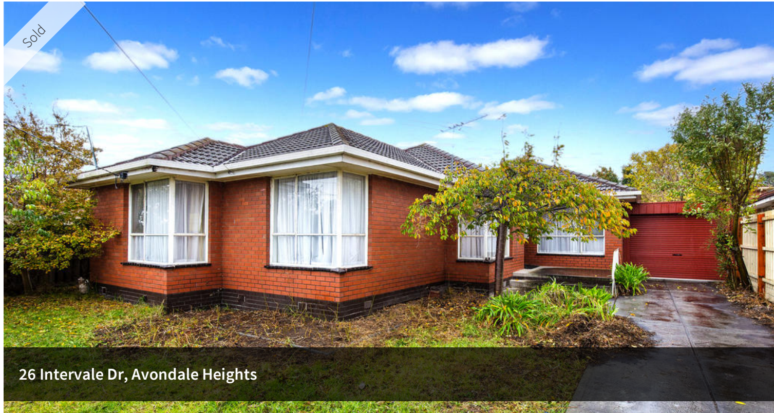
26 Intervale Dr, Avondale Heights