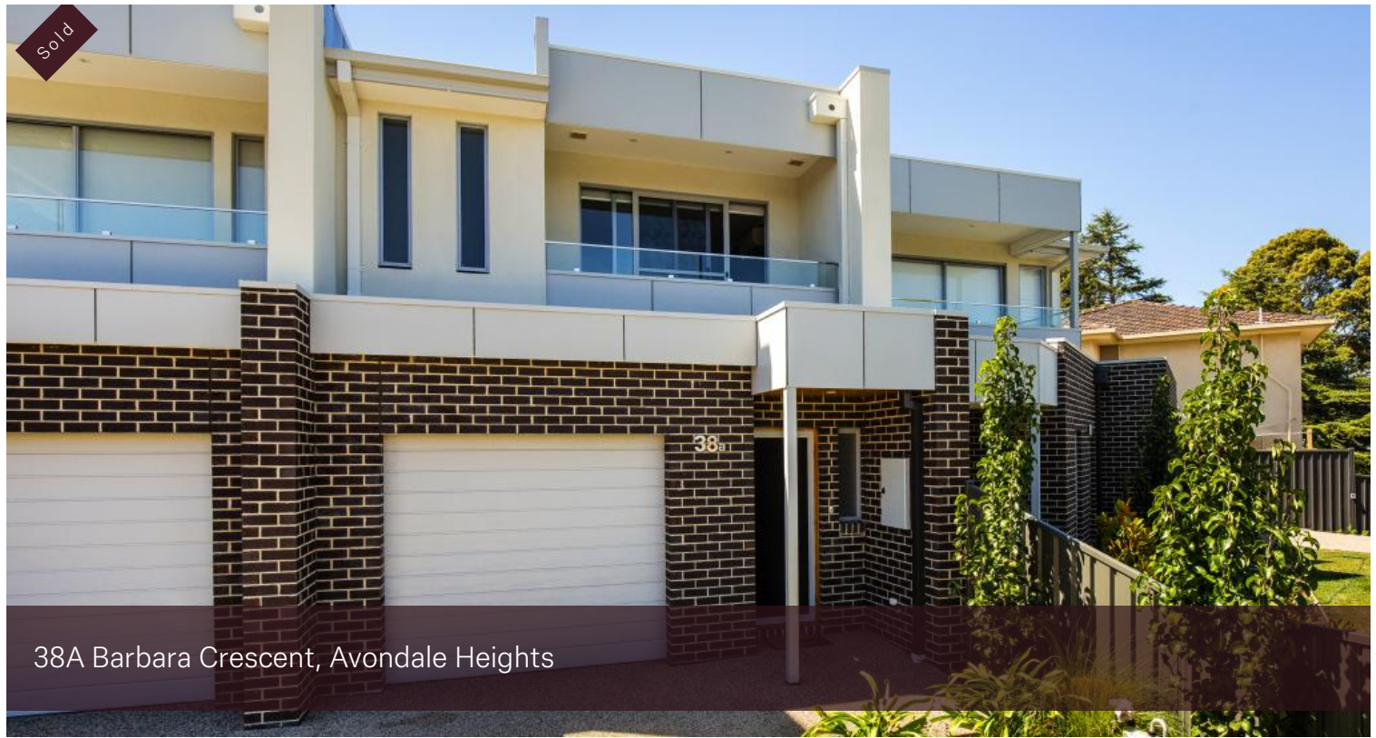
38A Barbara Crescent, Avondale Heights