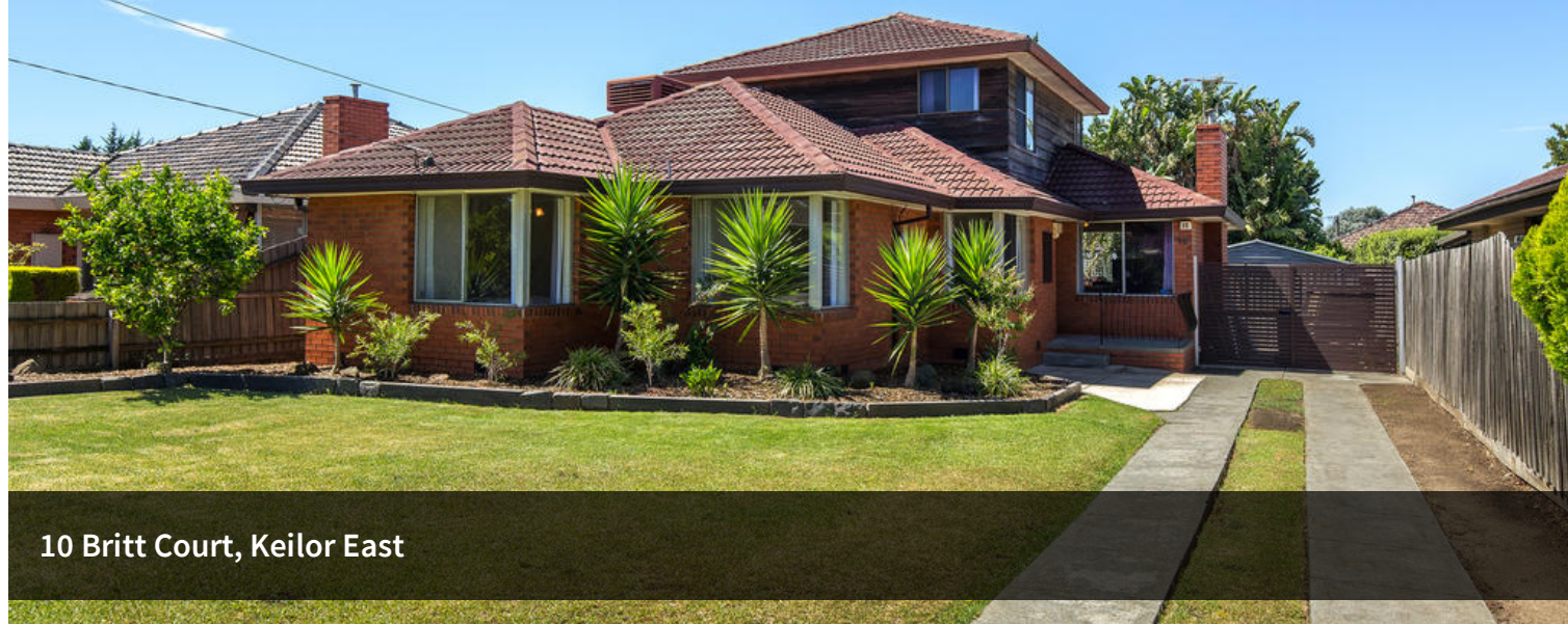
10 Britt Court, Keilor East