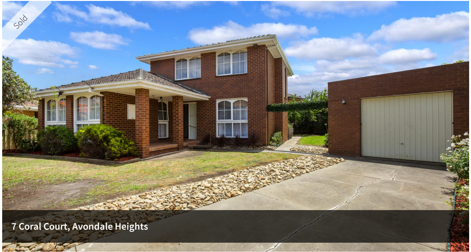
7 Coral Court, Avondale Heights