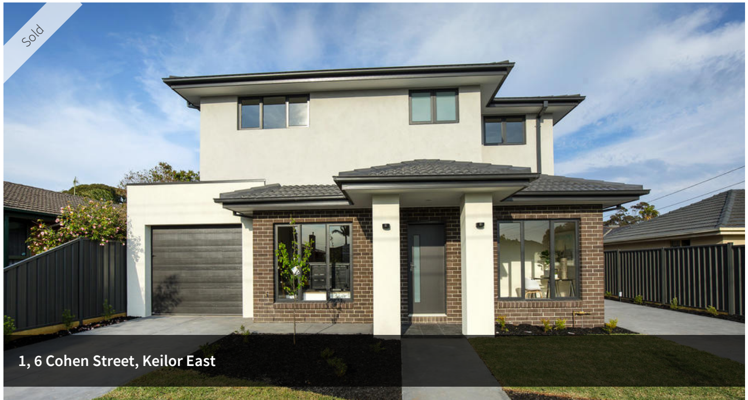
1, 6 Cohen Street, Keilor East