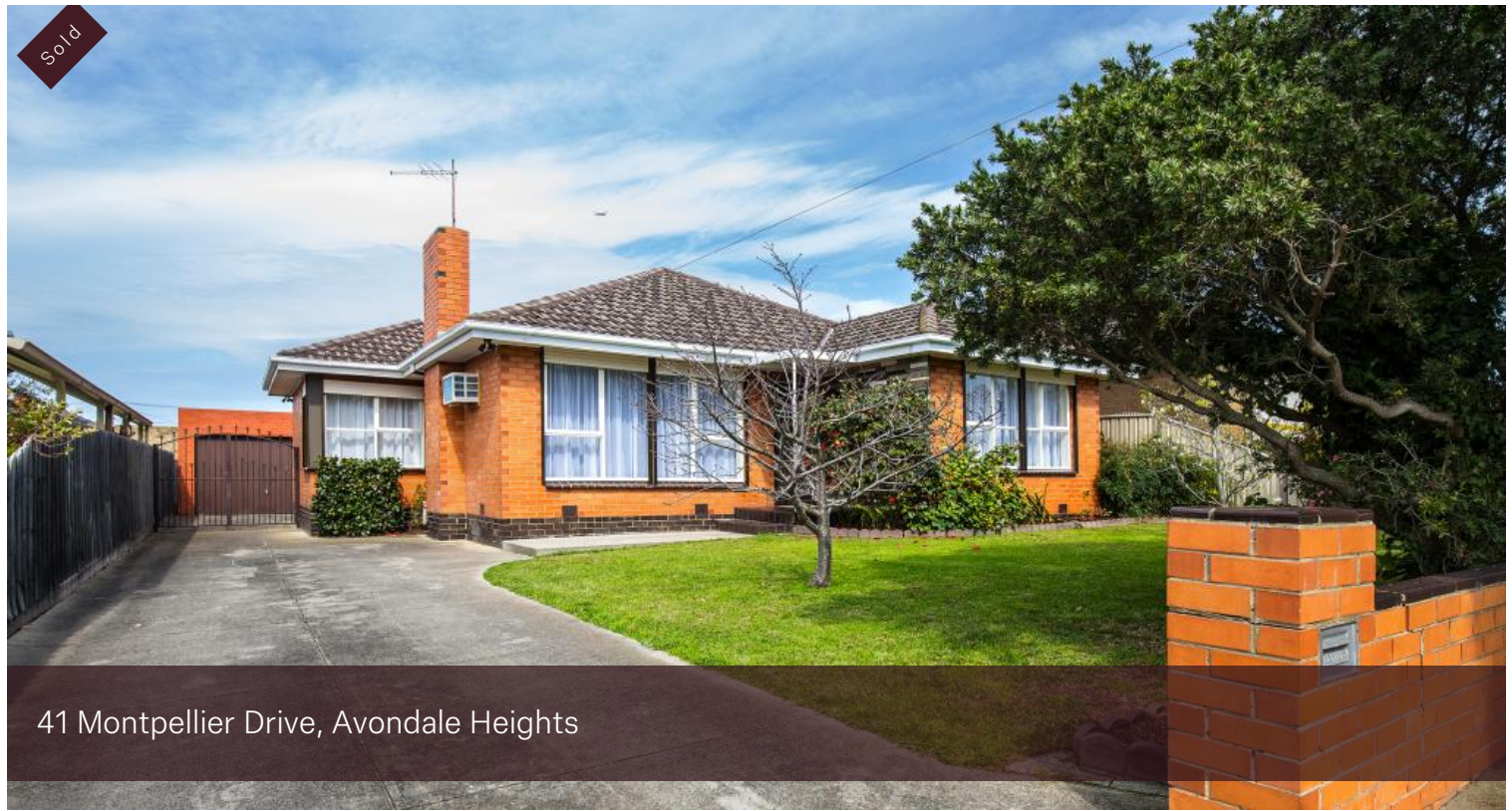
41 Montpellier Drive, Avondale Heights